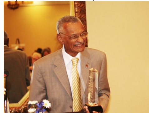
Dr. C.T. Vivian smiles as he accepts an award for being the Keynote Speaker at the 2 nd Annual ACCORD/Northrop Grumman Freedom Trail Luncheon at the Casa Monica Hotel. July 2, 2008